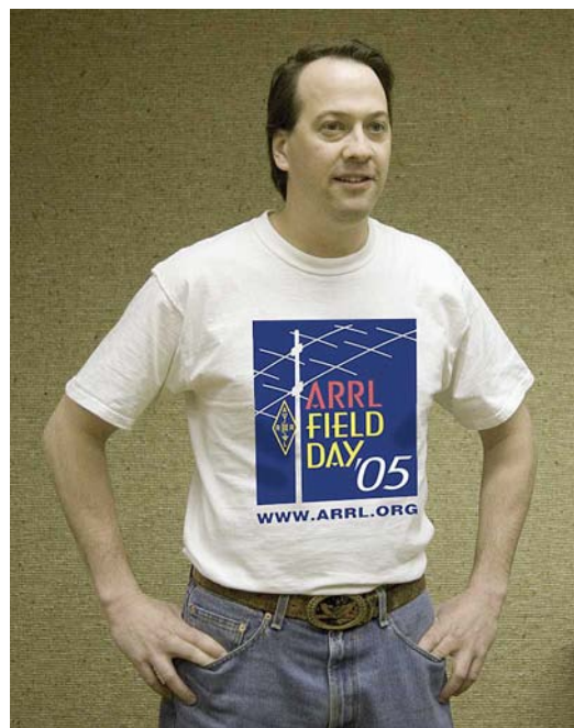
2005 Field Day T-Shirts Soft, pre-shrunk, heavy weight cotton (Hanes Beefy Tee)