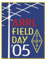
2005 Field Day Pins Size 3/4" x 1-1/4"

QUICK ORDER on the ARRLWeb: www.arrl.org/FieldDay (See reverse side for Mail-In Order Form )